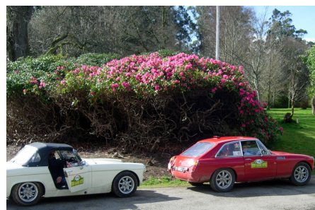
MG corral at Avondale