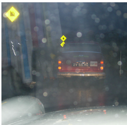
There were a few drops of rain on Friday evening