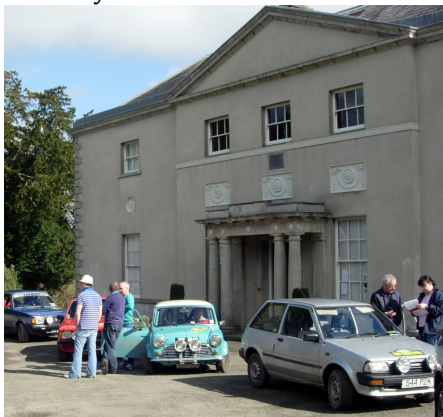
Morning Coffee at Avondale on Saturday

Friday night consisted of just five tests to get everybody in the mood for what turned out to be a very demanding Saturday.