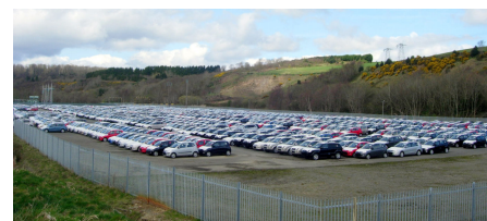
Loads of cars in Holfelds

Thank you marshals and everybody else who helped to make the event the success that it was