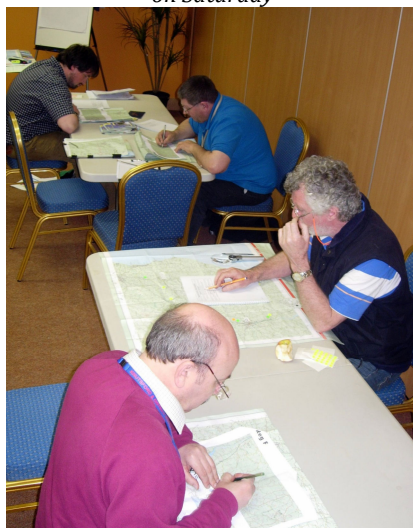
Plotting the Night Leg at the Supper Halt