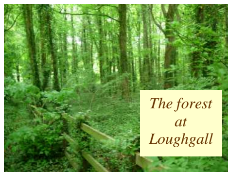
The forest at Loughgall